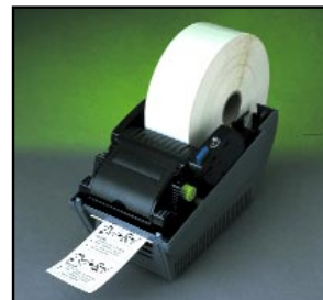
500 foot media roll option.

Del Sol is the most versatile desktop printer on the market with leading edge power, performance, and a low price point.